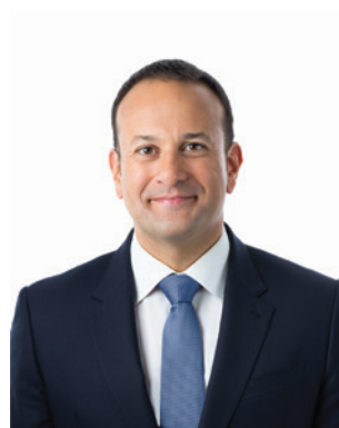
Leo Varadkar TD, Tánaiste and Minister for Enterprise, Trade and Employment

I want to thank everyone who contributed to this document. It will point the way.