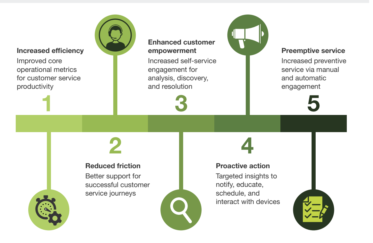
FIGURE 3 The AI-Fueled Customer Service Value Chain